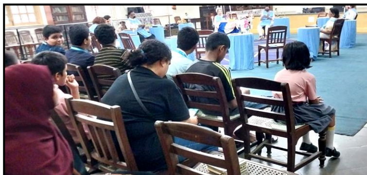
Students waiting for distribution of Dani Notebooks to start had an opportunity to observe The Mystic Star Ritual. They tried to follow the Ritual Books kept for them.