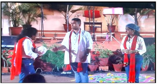
A child critical, but Doctor demanding High Fees before treating the child

The 148th Convention as appreciation not only hosted 4 Students & 2 Teachers' Boarding & Lodging, but also gave their travel expenses.