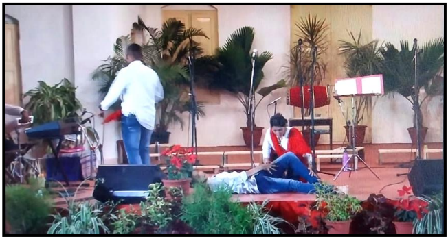
Not bothered about Road Accident Victim

The Skit – Street Play had begun questioning , "Where is Humanity? Is it Lost?" and had ended on a note, "HUMANITY IS WITHIN US - LET US AWAKEN IT - LET US BE THE CARRIER OF HUMANITY".