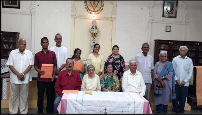
Recipient of Diplomas with BTF & Blavatsky Lodge Office Bearers