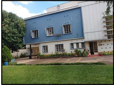
TS Premises in Nairobi, Kenya