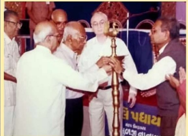
Lighting lamp at the 76th Annual Adhiveshan of the Gujarat Theosophical Federation